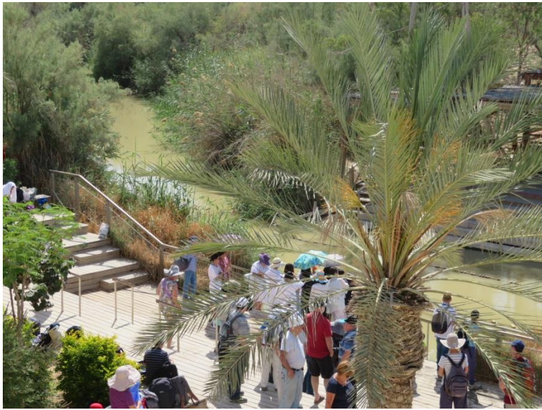
Bethany across the Jordan